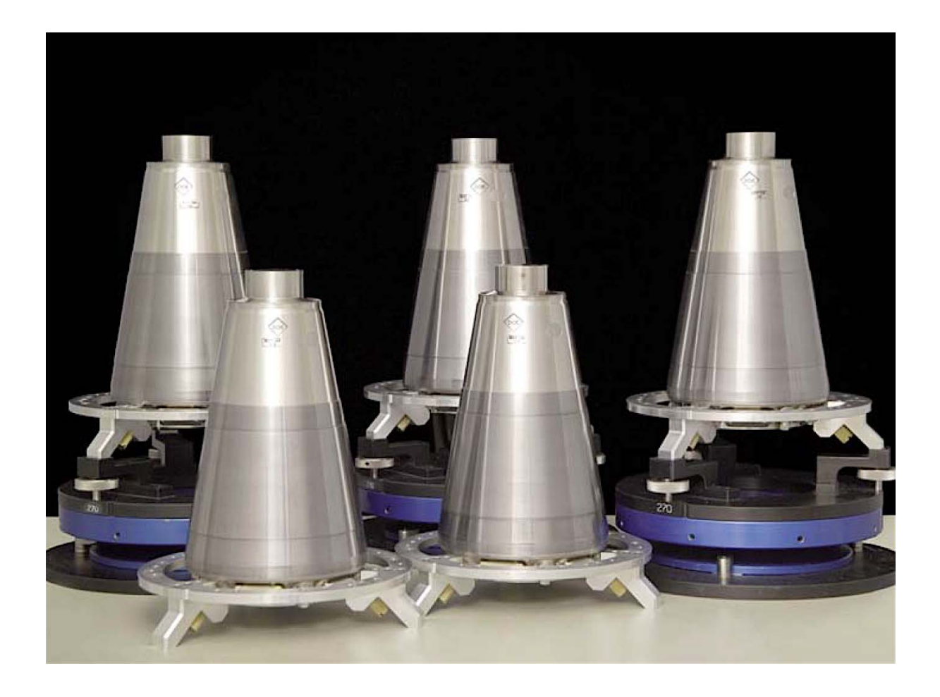
Figure 1. A new fuze on the life-extended W76-1 warhead gives the weapon increased targeting flexibility and effectiveness.

Atomic Scientists , 1 March 2017, http://thebulletin.org/how-us-nuclear-force-modernizationundermining-strategic-stability-burst-height-compensating-super10578.